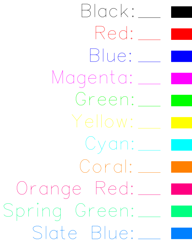
Fig. 4. Image created with a linewidth setting of 2.