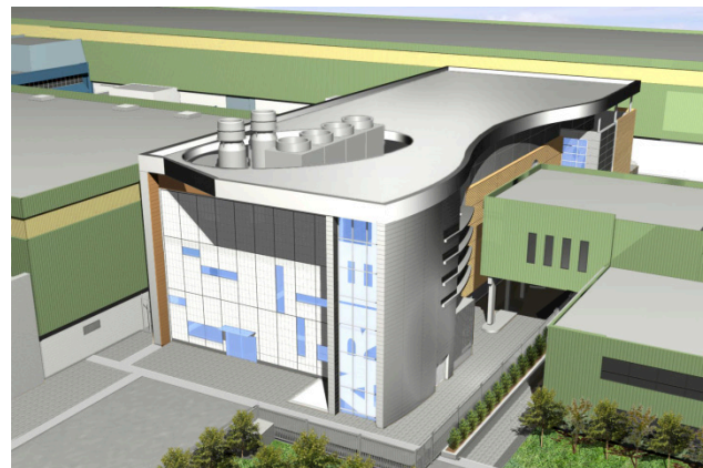
Figure 1. Architects' rendition of the ARIEL building.

Funded up to now are the 25 MeV, 100kW electron linac and civil construction to encompass the objectives of the entire ARIEL program.